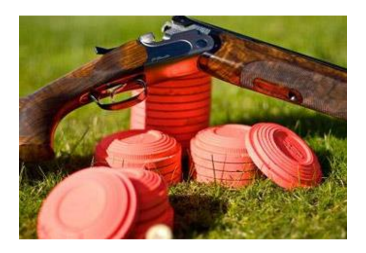
Friday June 17, 2022

https://swohio.assp.org/events/swohio-sporting-clays-scholarship-fundraiser-june-17-2022/?