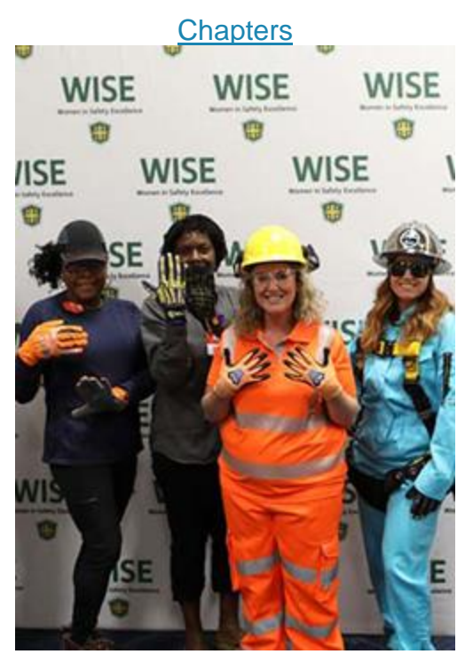
Common Interest Groups